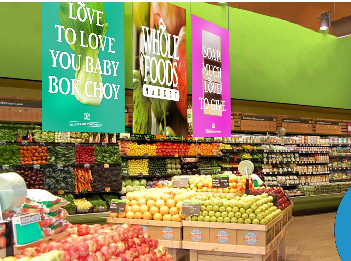
Hanging Banner Application