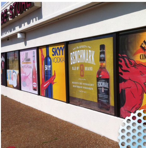
Hole Size: 1.6 mm, Perf Ratio of 42.94%

PV1 has the right amount of vinyl for optimum graphic, 60% and the perfect amount of perforation for outside view, 40%. Exterior window mount perforated 7 mil calendared white vinyl with removable adhesive. Comes with paper liner and is durable enough to last 3 years outdoor.